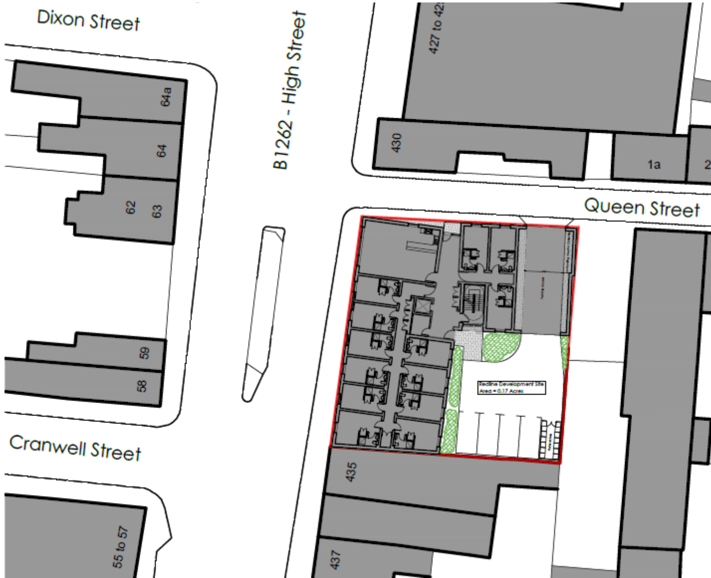
Indicative Site Layout (Access Position is Fixed)