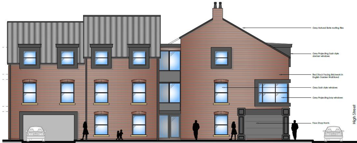
Indicative Queen Street Façade