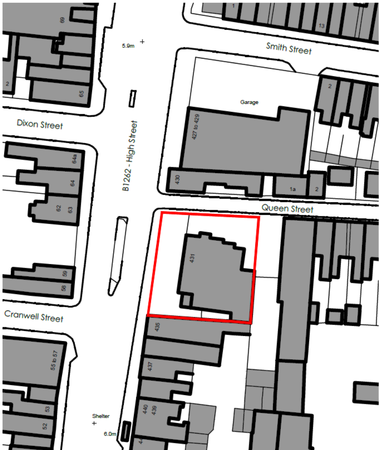
Site Location Plan (Showing Existing Building)