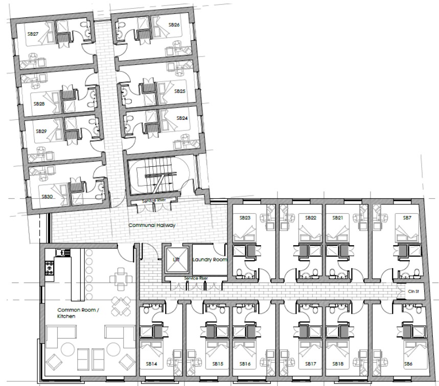
Indicative First Floor Layout (17 Bedrooms)