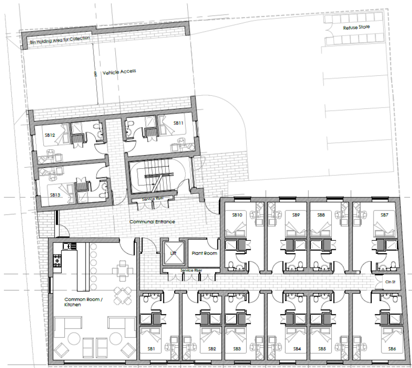
Indicative Ground Floor Layout (13 Bedrooms)