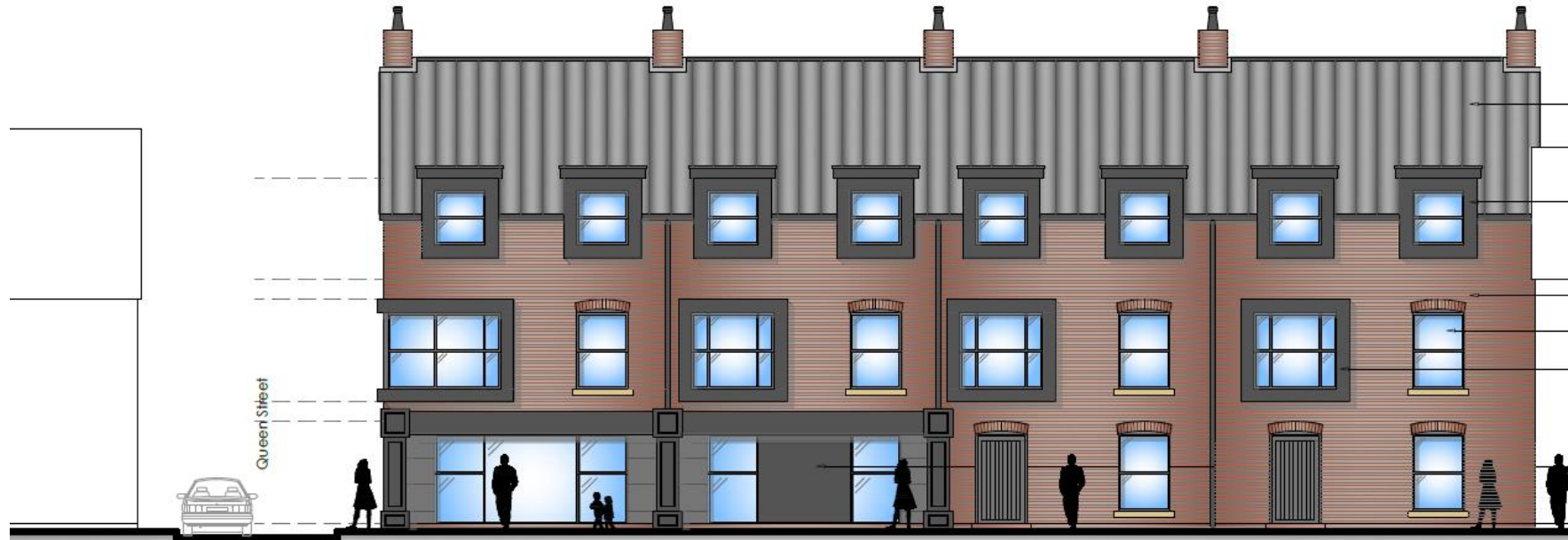
Indicative High Street Façade